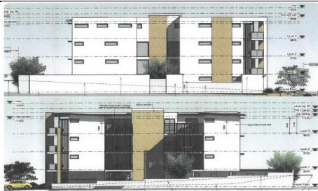
Apartments & Penthouse : Booragoon - Western Australia.