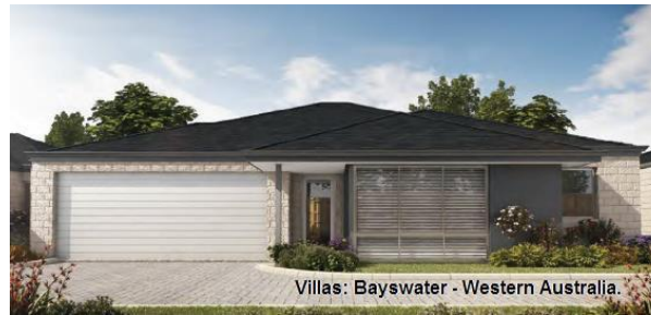
Villas: Bayswater - Western Australia.